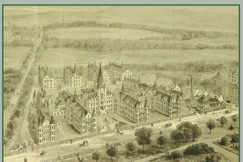
Royal Infirmary of Edinburgh 1879-2003