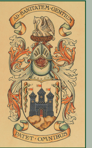
Coat of Arms 1914