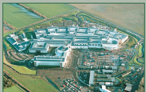
Royal Infirmary of Edinburgh 2002-