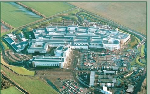
Royal Infirmary of Edinburgh 2002-

Original English text reproduced in 'The History and Statutes of The Royal Infirmary of Edinburgh', 1778