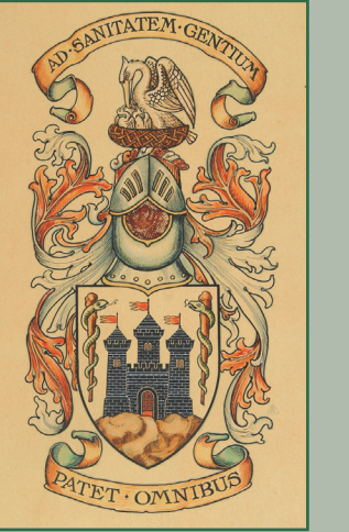
Coat of Arms 1914