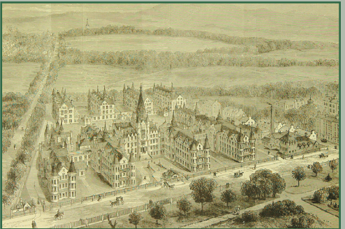
Royal Infirmary of Edinburgh 1879-2003